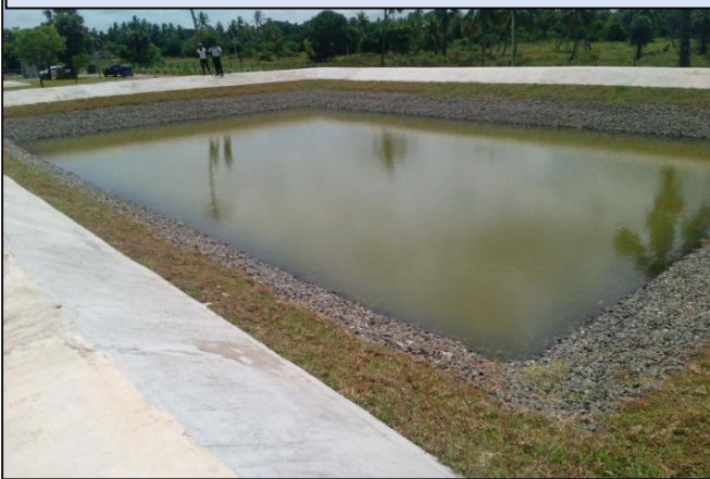
Septage Plants - Chilaw