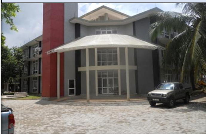
RSC Building Vavuniya