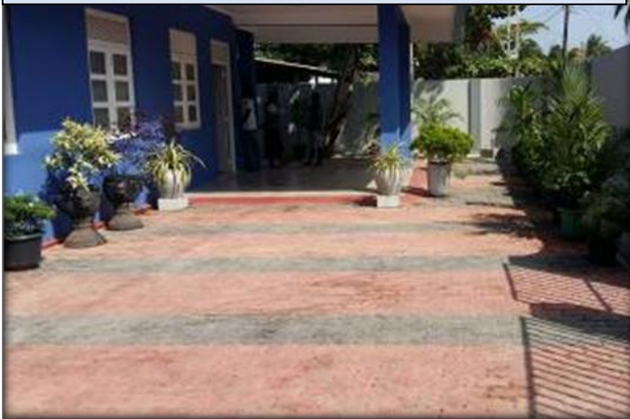
Mannar – Admin Building