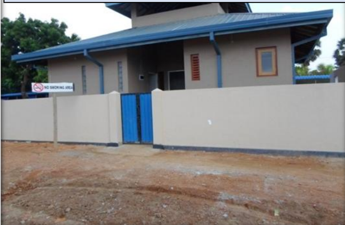
Public Toilets Stage 1 Mannar