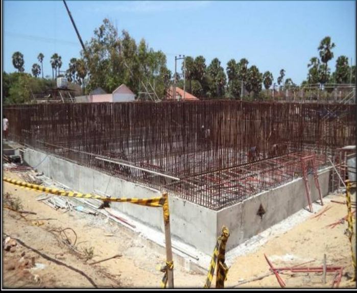
Store at Eluthoor