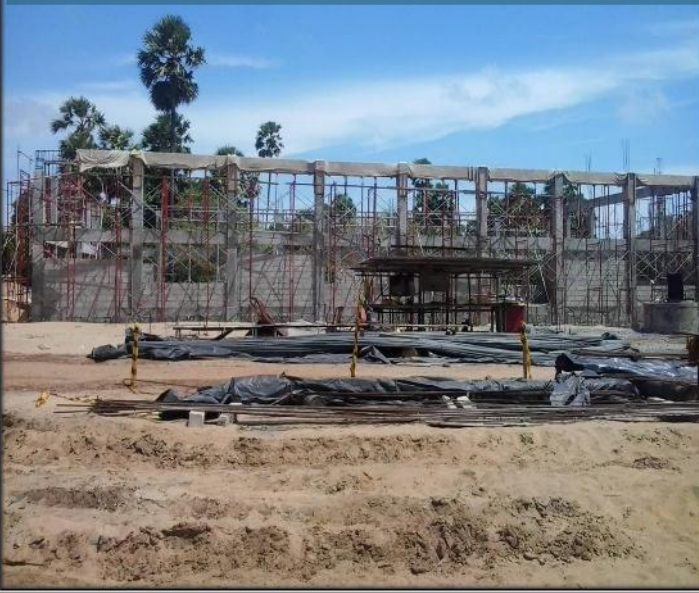
Sump at Murunkan