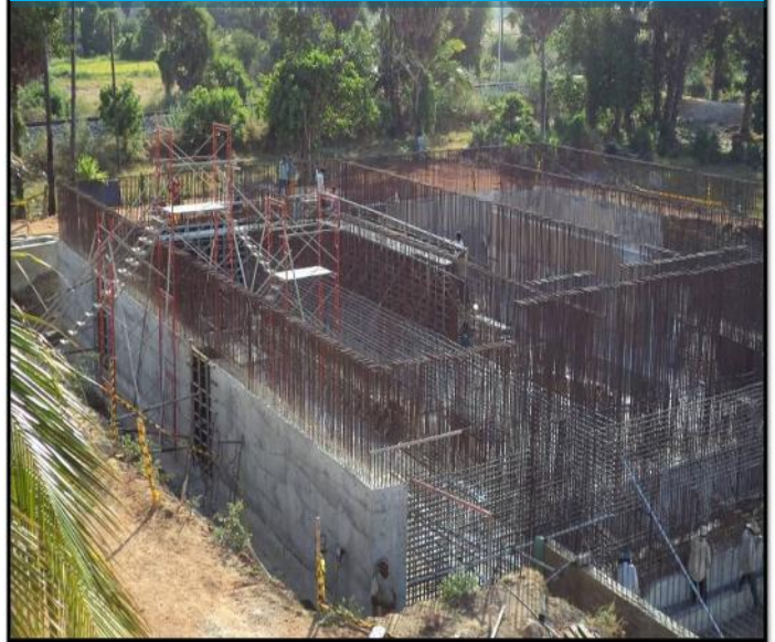
Sump at Eluthoor