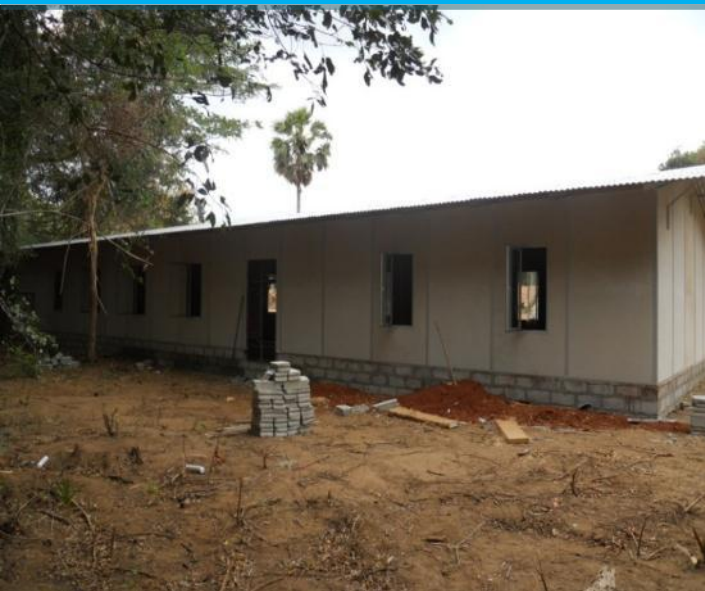
Site Office Construction work-Treatment Plant