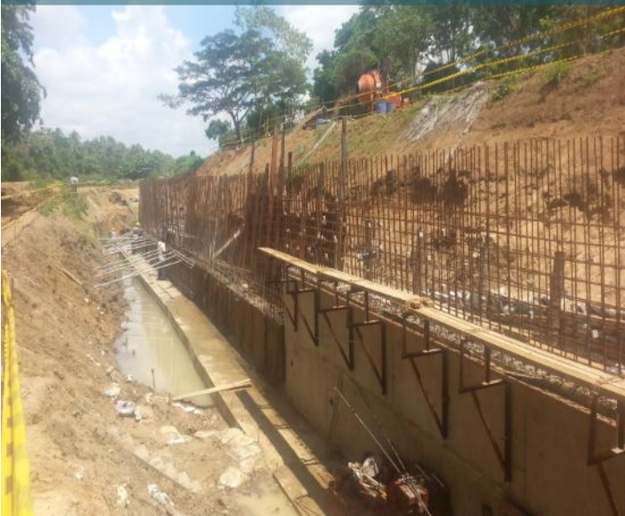
Deduru Oya Intake Site-Left bank Protection work