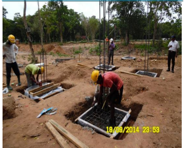
Aerator Footing work