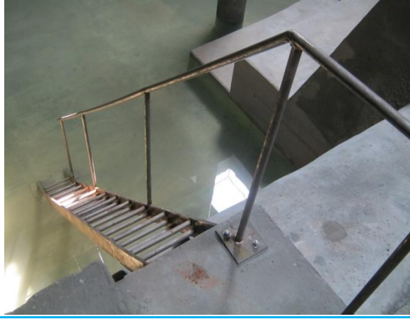
EH 2&3 , Ladders in side Reservoir.