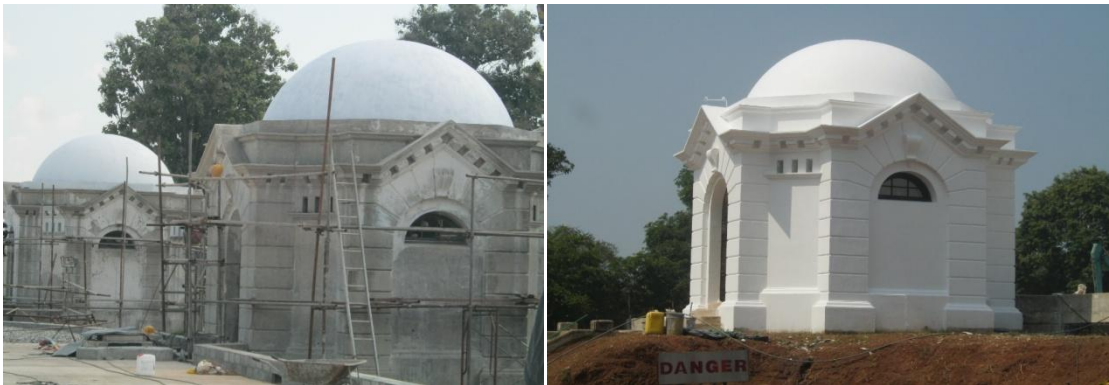
EH 2&3 , Rehabilitation of Existing Inlet Structures EH 2&3 , Rehabilitated Inlet Structure .