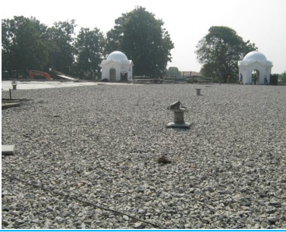
EH 2&3 , Crush Stone Filling on Roof Slab.